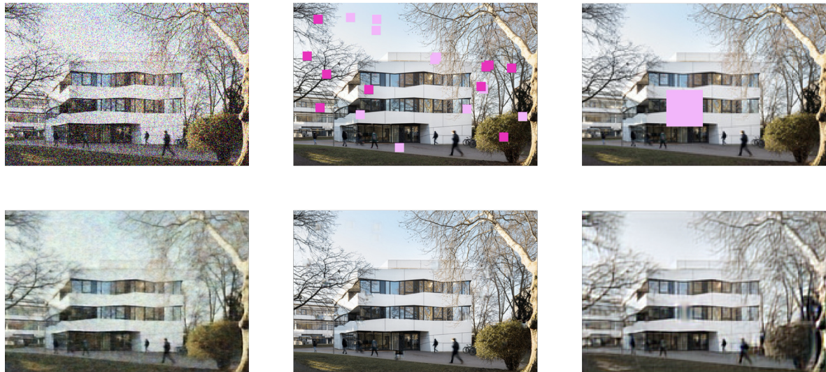
Figure 4: Image reconstruction using a variational autoencoder (VAE) in the presence of noise and obstructions.