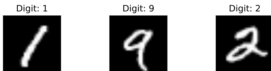
Figure 1: Example digits from the MNIST dataset, along with their label

You can download our example code from the course website and run all cells from the notebook. Make sure that the code runs without problems and that you understand the Flux syntax.